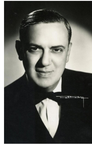
Ernesto Lecuona (1895-1963)

Tribute to Cuba in this special program dedicated to three major figures of the territory. Manuel Saumell was called "Cuba's Little Schubert", as he was one of the founding fathers of Cuban music. By mixing Western classical and Creole traditional, he created some kind of revolutionary fusion style. His contradanzas, performed today, are little songs with a festive heart.