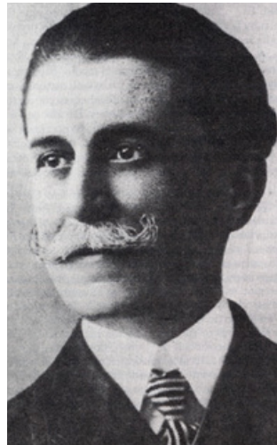
Ignacio Cervantes (1847-1905)