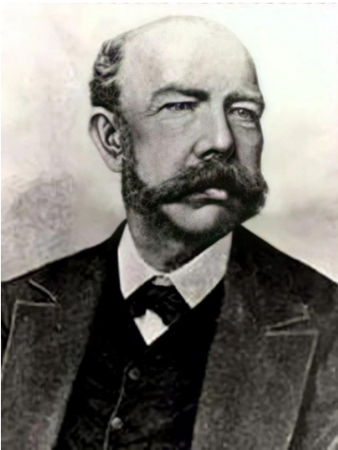
Manuel Saumell (1818-1970)