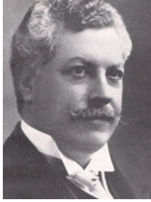
Alberto Williams (1862-1952)