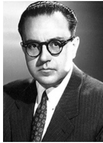
Alberto Ginastera (1916-1983)