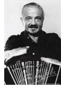
Astor Piazzolla (1921-1992)