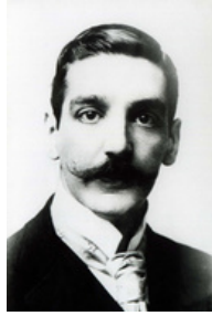
Julian Aguirre (1868-1924)