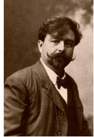
Isaac Albéniz (1860-1909)