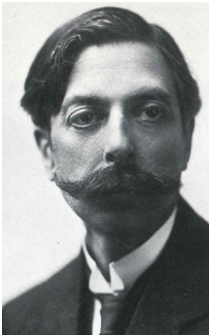
Enrique Granados (1867-1916)