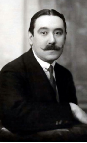
Joaquin Turina (1882-1949)