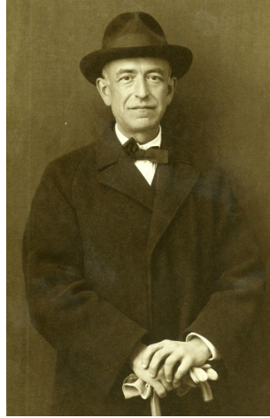
Manuel de Falla (1876-1946)