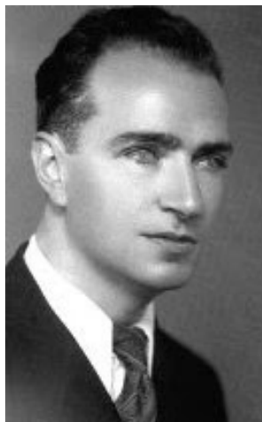
Joaquin Rodrigo (1901-1999)